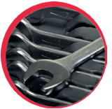
Combination spanner set