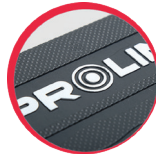
PROLINE logo embossed on the case