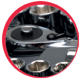
Ratchets 1/2", 3/8", 1/4" 72 teeth